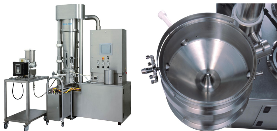
Vector Corporation Granurex GXR-35