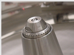
Spray Gun with Diverter Sleeve